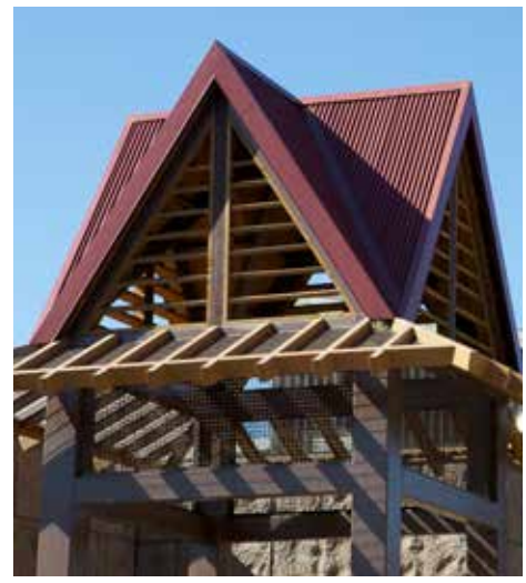
7/8" Corrugated Panel, Denver Zoo, Denver, CO

•UL 263 - Fire Tests of Building Construction and Materials.