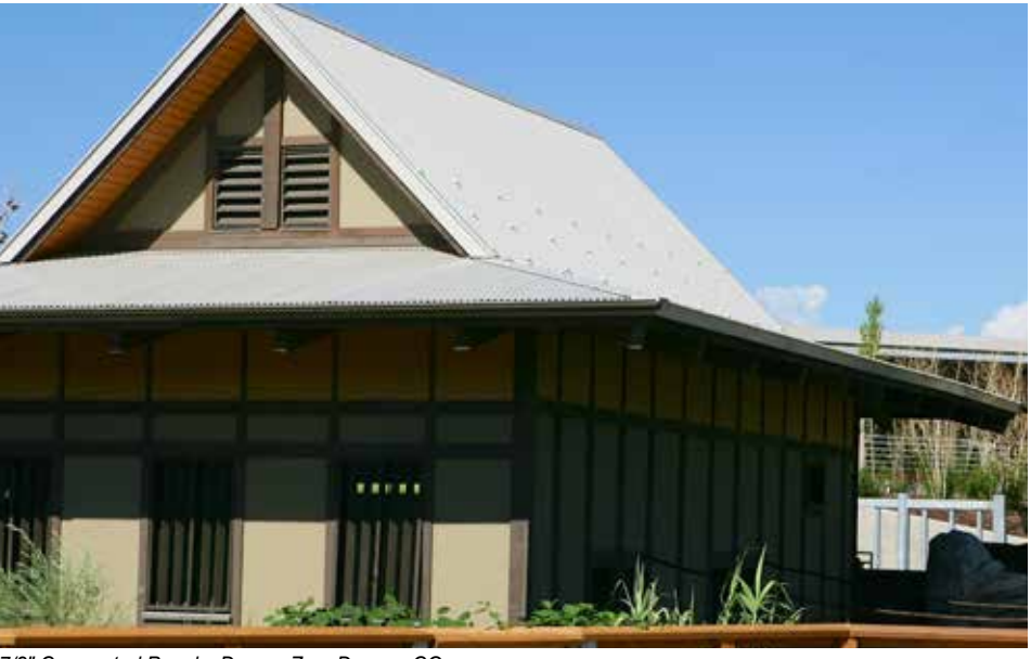
7/8" Corrugated Panels, Denver Zoo, Denver, CO