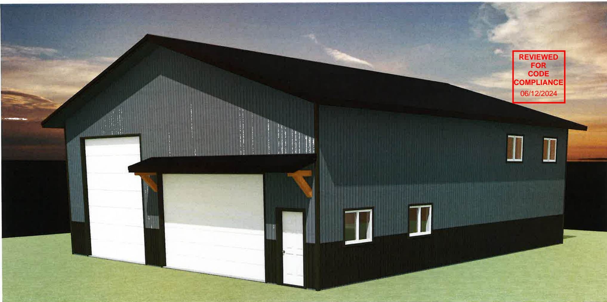
- NORTHWEST ELEVATIONS

13921 - STEPHEN JONES 28305 YELLOW JACKET DR. OAK CREEK, CO 80467 PROPOSED 40' x 50' x 16' POLE STRUCTURE