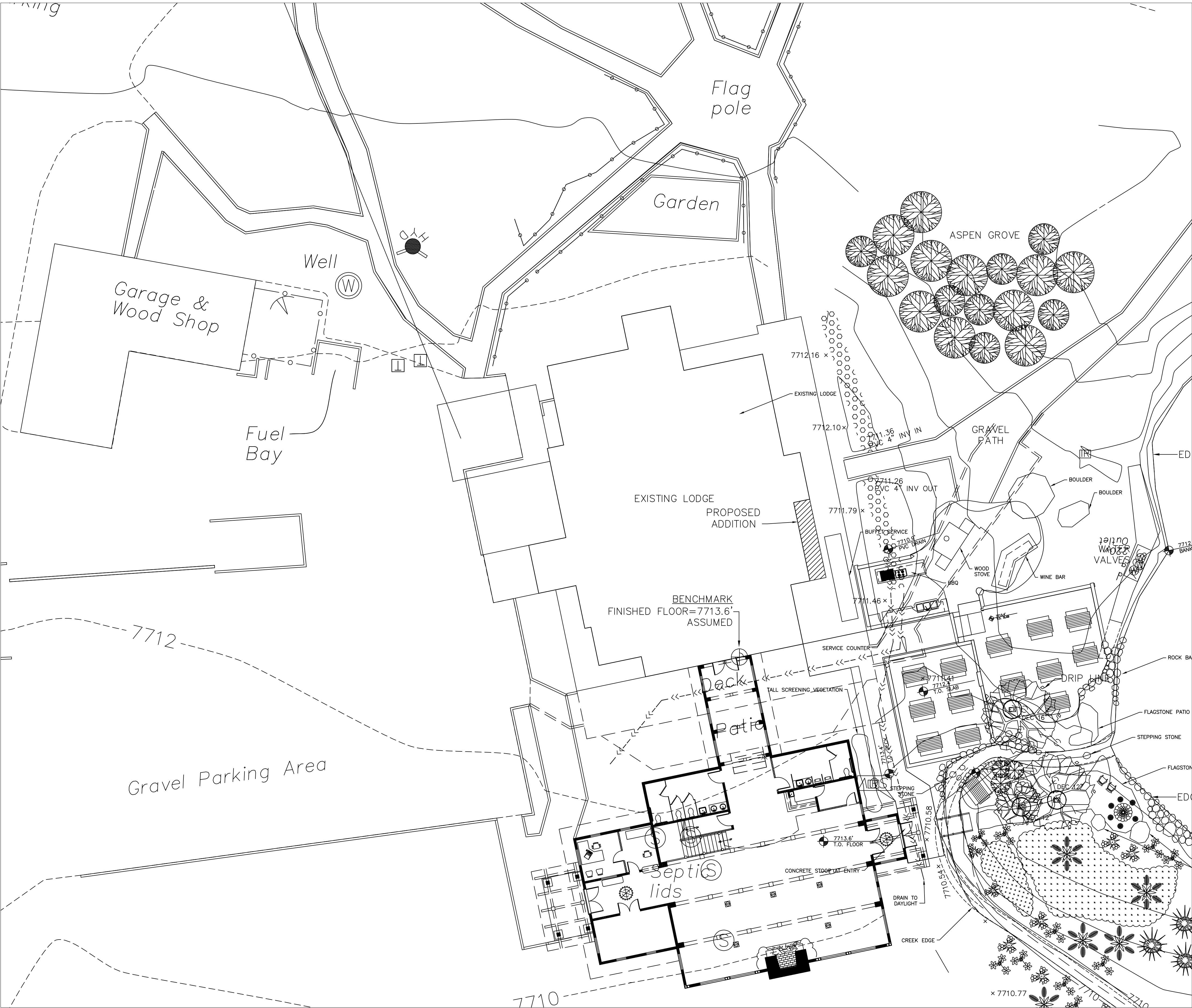
1 SITE PLAN

ZONING: AF DISTRICT: ROUTT COUNTY ADDRESS: 58000 COWBOY WAY SET BACKS: 50' FRONT; 50' REAR; 50' SIDES.