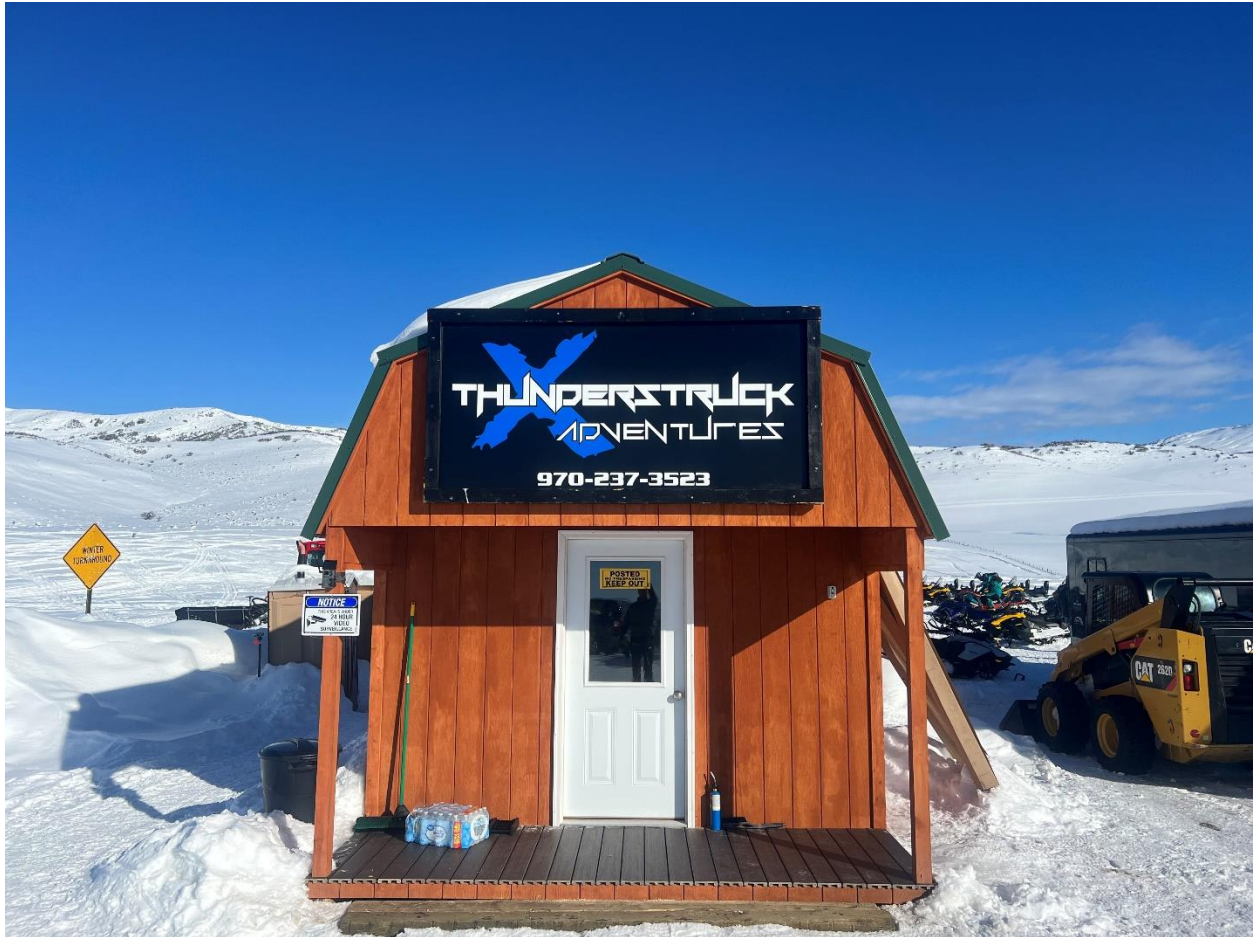
Full sign drawing and design 4'x8'

The location of the sign will be on the front of 12x36 shed and is 4'x8' in dimensions. (picture is to scale)