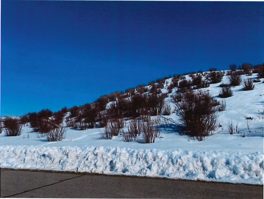
Steep hillside comprises most of the lot with slopes over 30%