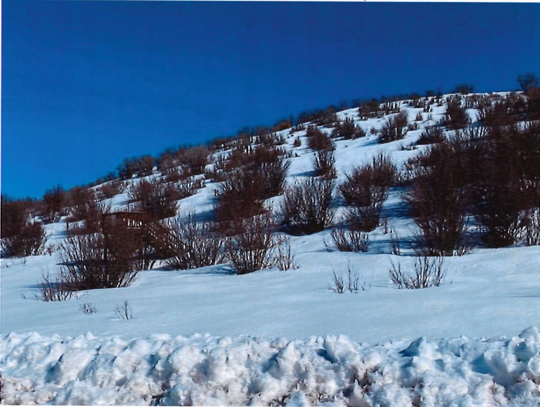
Viewing stand in flatter portion of the lot with about 10-15% slopes