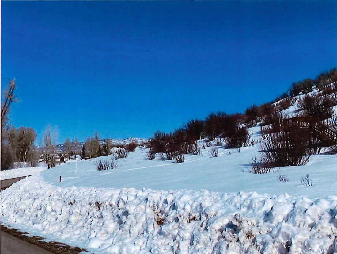
One more view of the flattest portions of the lot