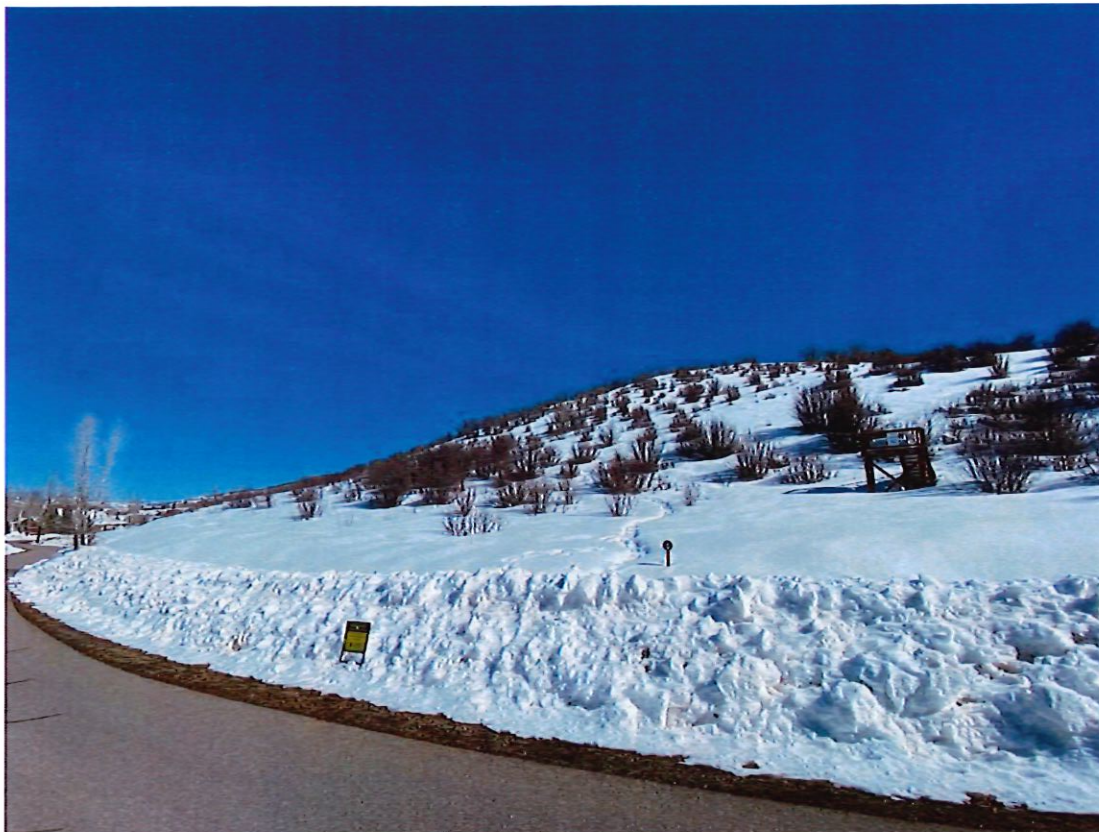
Lot 42 viewed from Waterside Ct facing NE