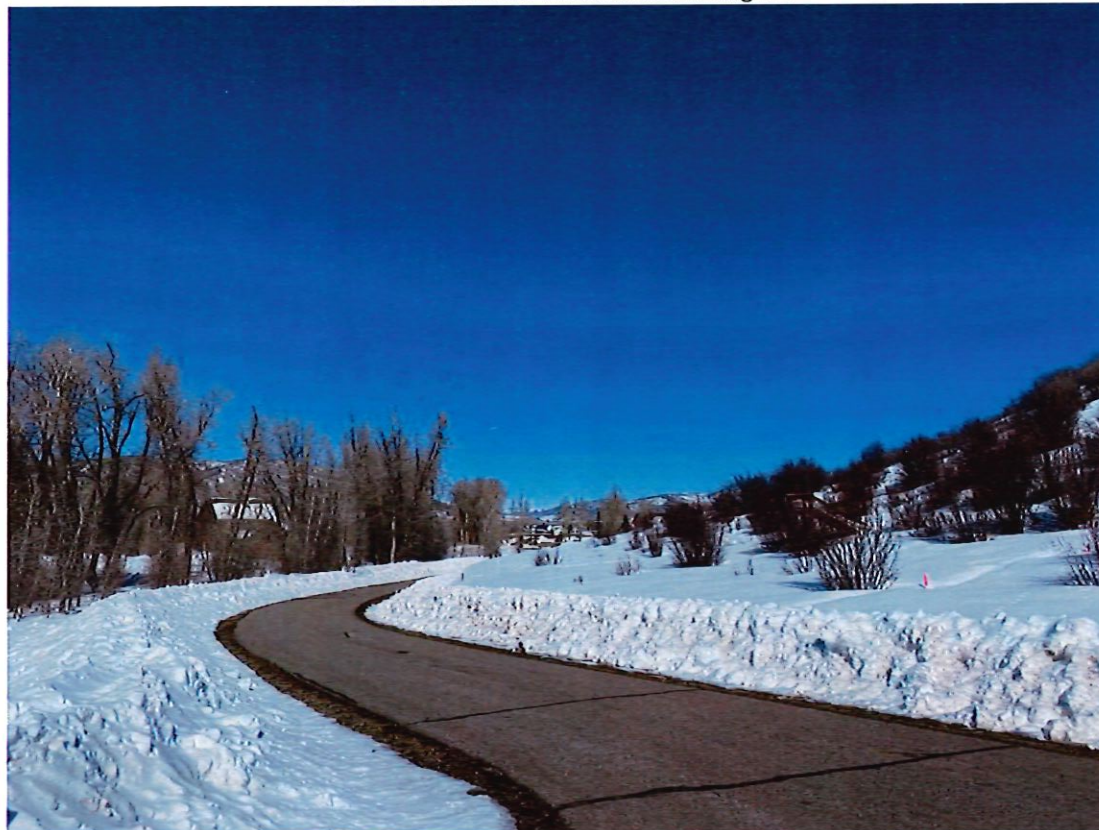
The entrance to AMR and Sales office can be seen in the distance behind the cottonwood tree