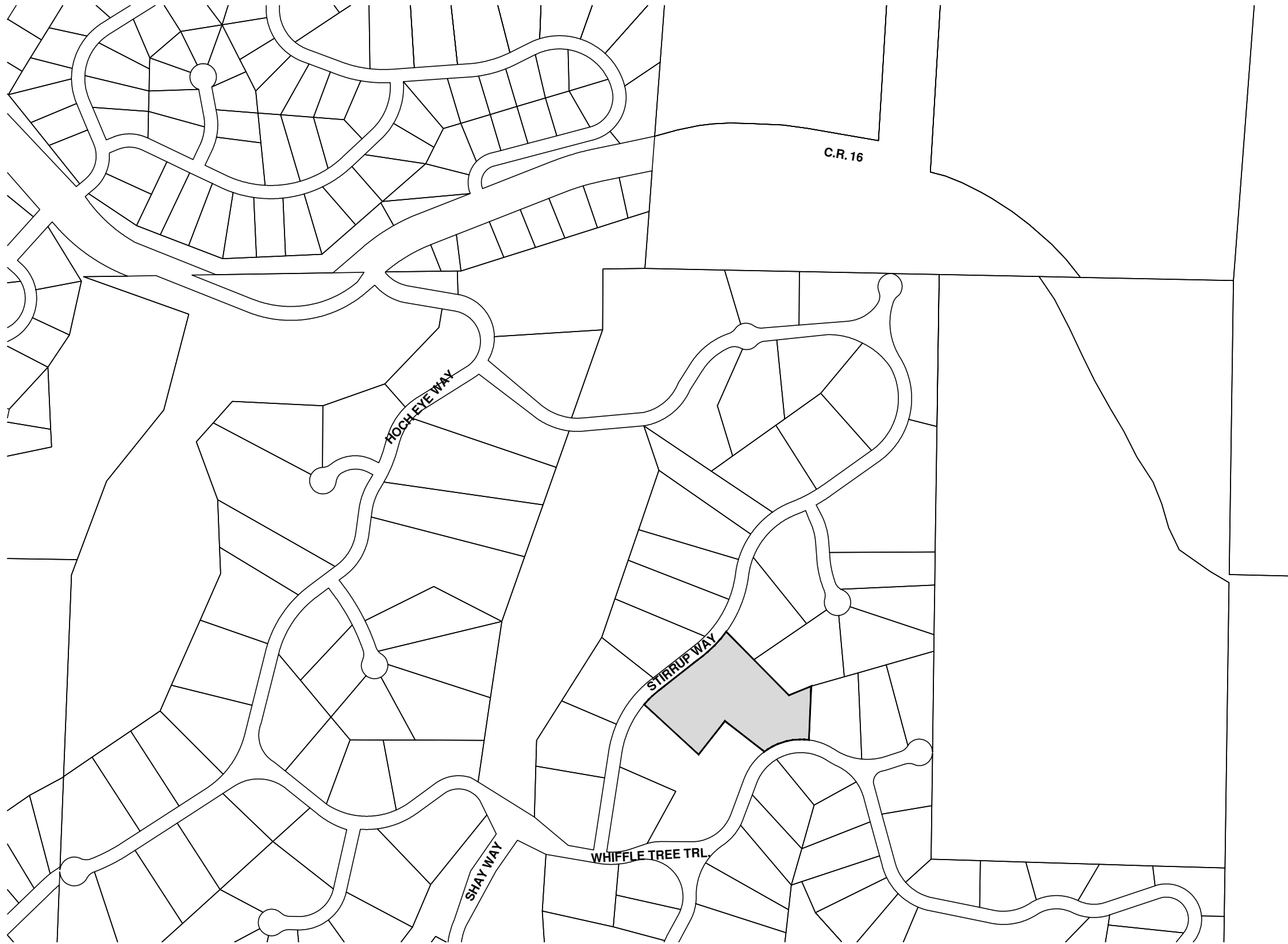
VICINITY MAP 1" = 500'

LOCATED IN THE NW \frac{1}{4} OF SECTION 23, TOWNSHIP 3 NORTH, RANGE 84 WEST, 6TH P.M., ROUTT COUNTY, COLORADO