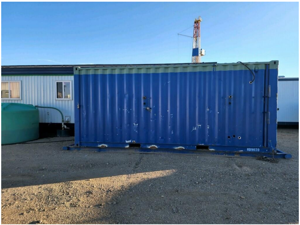
Figure 5:Side Elevation of Water Supply Conex