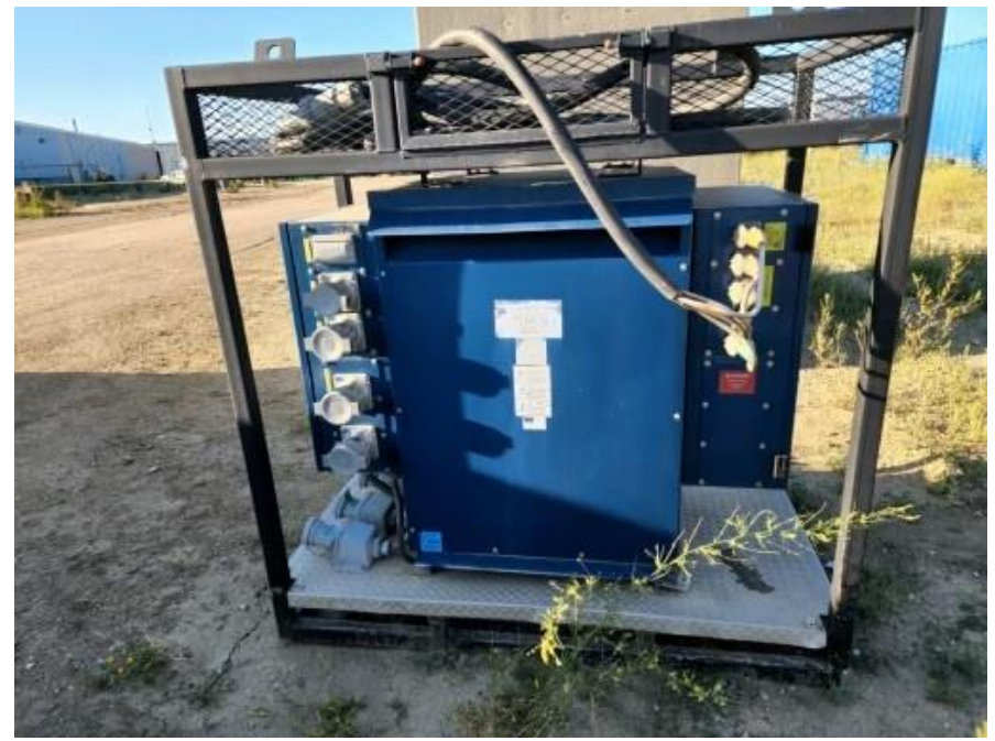
Figure 4: 480V/220V 112KVA Transformer