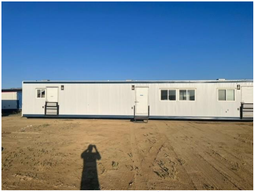
Figure 1: Front elevation of THU

Temporary Housing for Twentymile Mine THU Photos Pre-submittal Code: PS22-050 Identifier: Peabody TWH