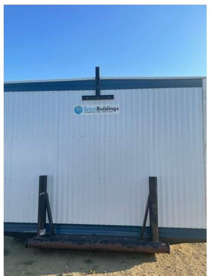
Figure 3: Side elevation of THU