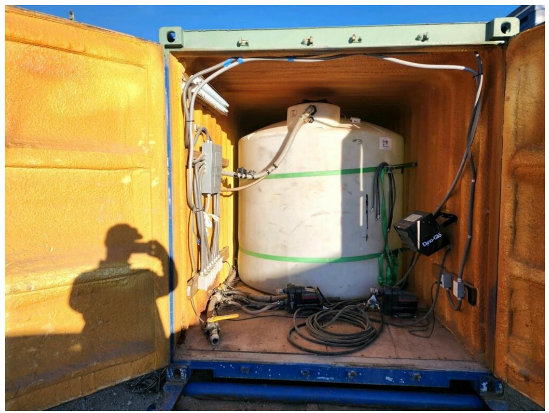
Figure 7: Inside Elevation of Water Supply Conex