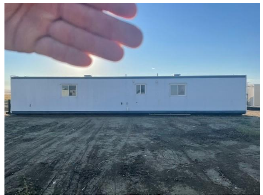
Figure 2: Rear elevation of THU