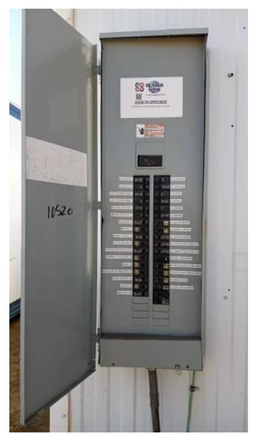
Figure 9: THU 100 amp service breaker panels