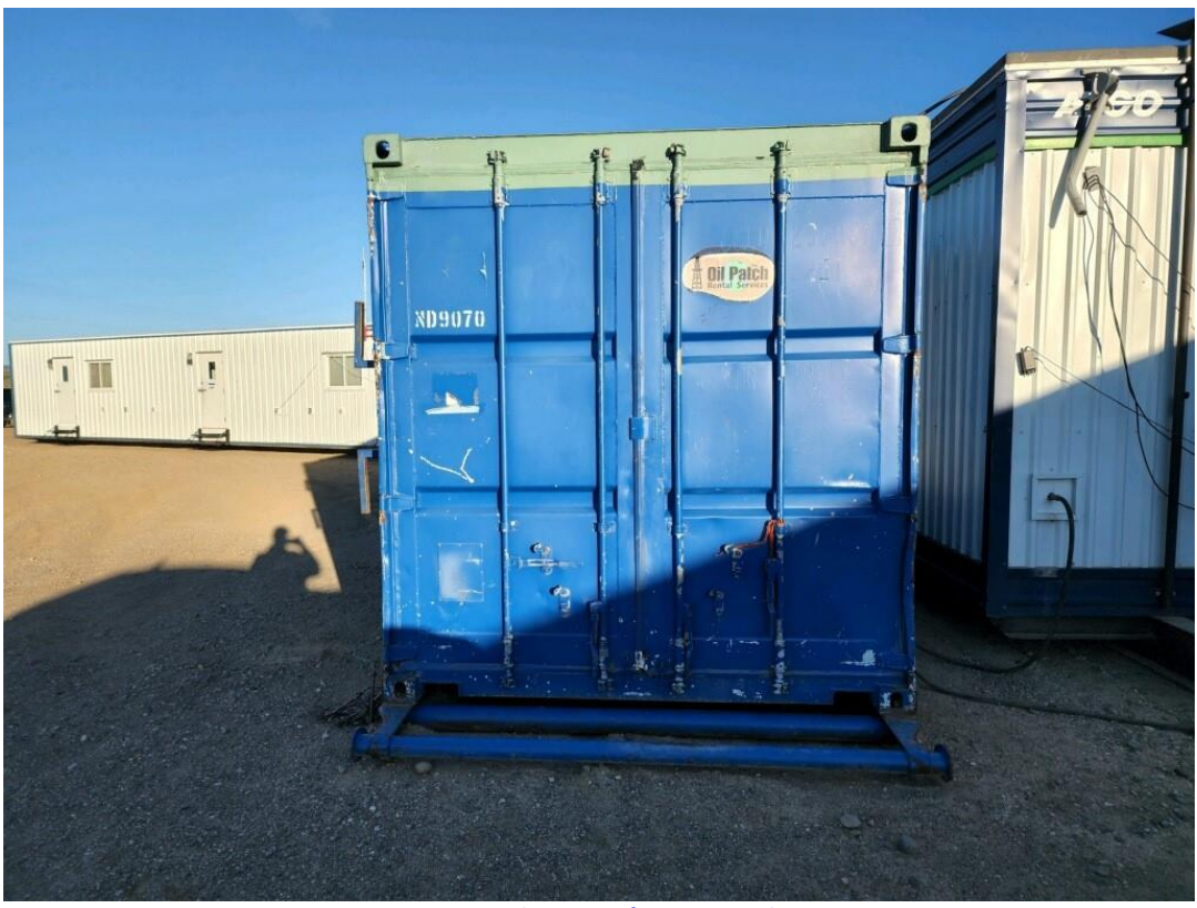
Figure 6: Front Elevation of Water Supply Conex