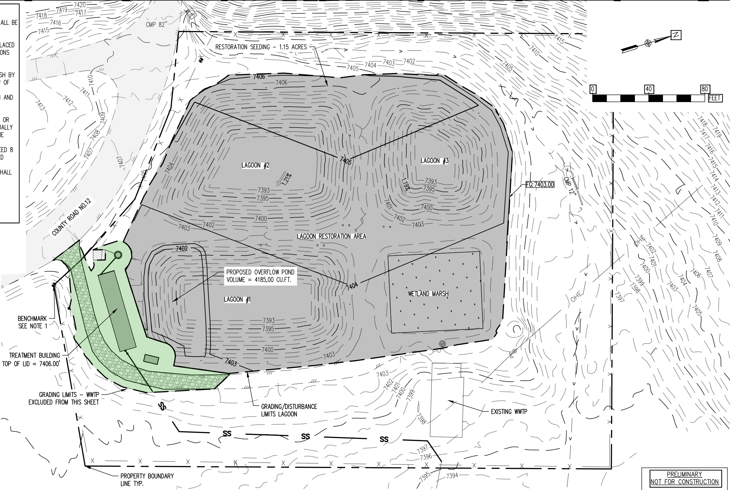
LAGOON RESTORATION PLAN 1"=40'